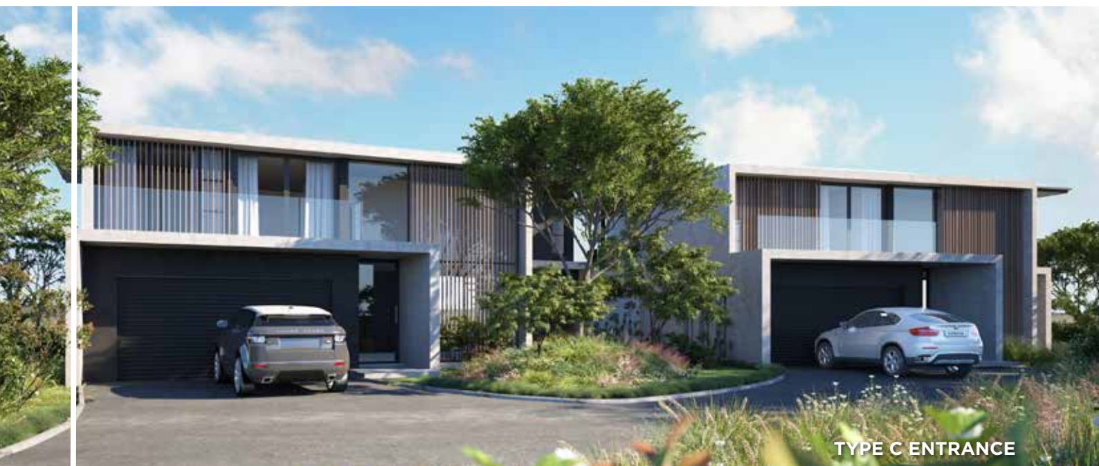
TYPE C ENTRANCE