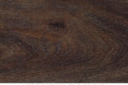
KBAC VINYL FLOORING AUTUMN OAK

External lighting: Outdoor lights, outdoor tread lights